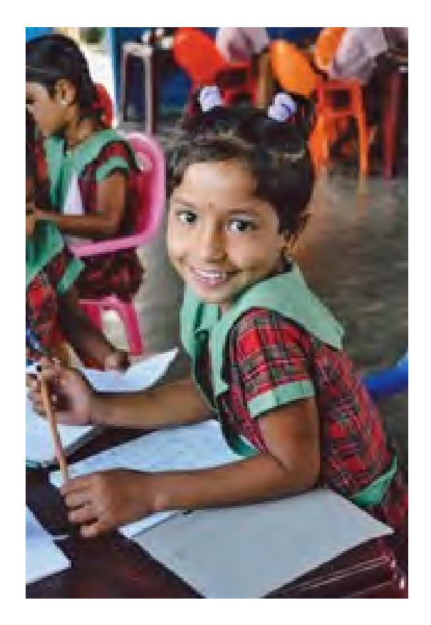
Fund for Children: A quick study break as a student poses for the camera.