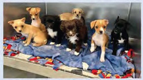
Sacramento SPCA (Society for the Prevention of Cruelty to Animals)