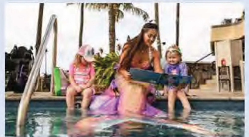
Make-A-Wish Foundation of Sacramento and Northeastern California